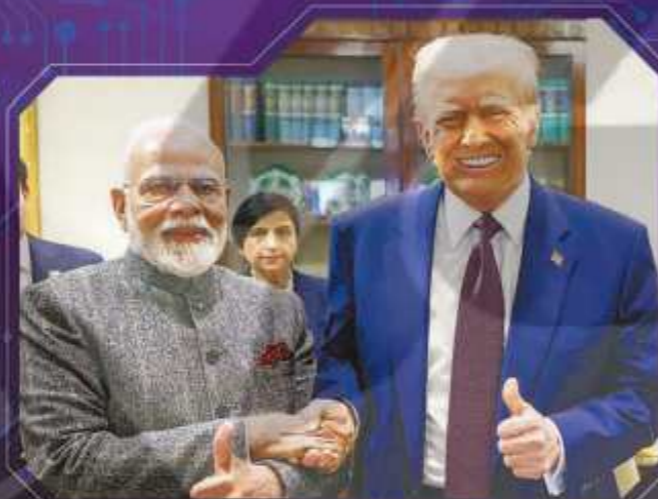
PM Narendra Modi with the President of USA, Mr. Donald Trump at the White House in Washington DC