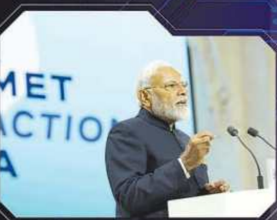
PM Narendra Modi attends AI Action Summit, in Paris, France, 11 February, 2025

3 Encrypting Defence & Security India joins Eurodrone MALE Programme as an observer Launched FRIND-X for defense innovation Strengthened DRDO-ONERA R&D partnership Enhanced NSG-GIGN counter-terrorism cooperation Focus on nuclear energy collaboration